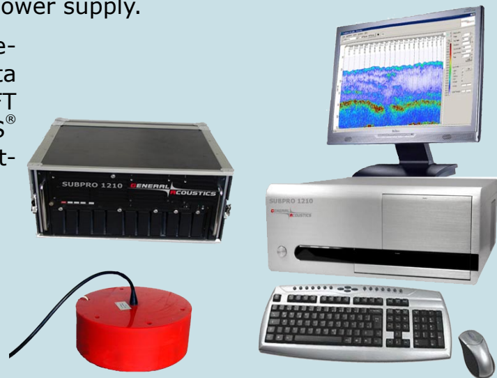
Complete SUBPRO 1210 System

Output: SEG-Y, XTF (optional), Ethernet, Printer, CD-R/DVD-R