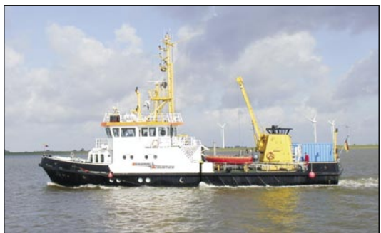
Fig. above: Example of Survey Ship