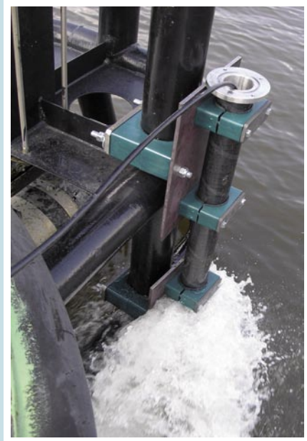
Fig. above: Example, mounting of the transducer at a tube