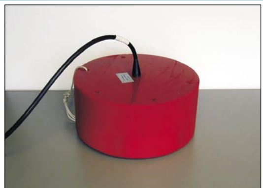
Fig. above: The 12 KHz transducer

The new state of the art high-frequency, high power sub-bottom profiler from General Acoustics, the SUBPRO 1210, with its advanced sending signal synthesis, high performance data acquisition, with high dynamic range and SNR and advanced signal processing is a universal survey system with outstanding advantages for a wide range of applications with different survey tasks.