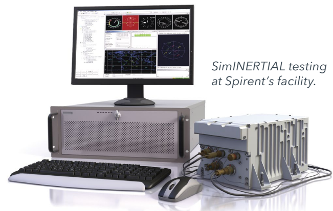
SimINERTIAL testing at Spirent's facility.

Spirent's SimINERTIAL architecture is also available in configurations to support transfer alignment and multiple sensor architectures.