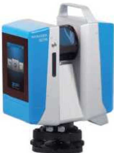
Z+F IMAGER® 5016

Should the automatic process fail, Z+F LaserControl® Scout provides easy tools for manual adjustments by simply dragging the scan into the approximate position. Scout further provides a new tool for complex geometries to manually align scans quickly in 3D.