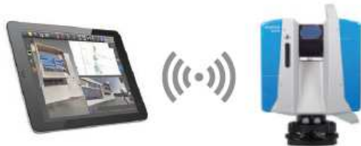
Remote control and synchronization

Free yourself of time pressure to hectically hide from the scanner. Control the instrument and check its status comfortably from a distance.