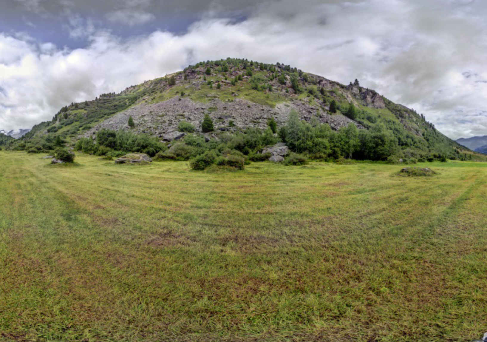
Debris field captured by the HDR camera of the Z+F IMAGER® 5016, Obergurgl, Austrian Alps