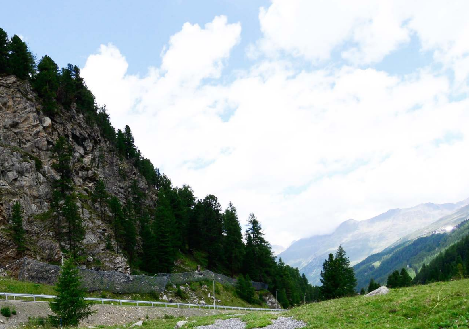
Captured spot that is subject to rockfall. Z+F IMAGER® 5016 in Obergurgl, Austrian Alps