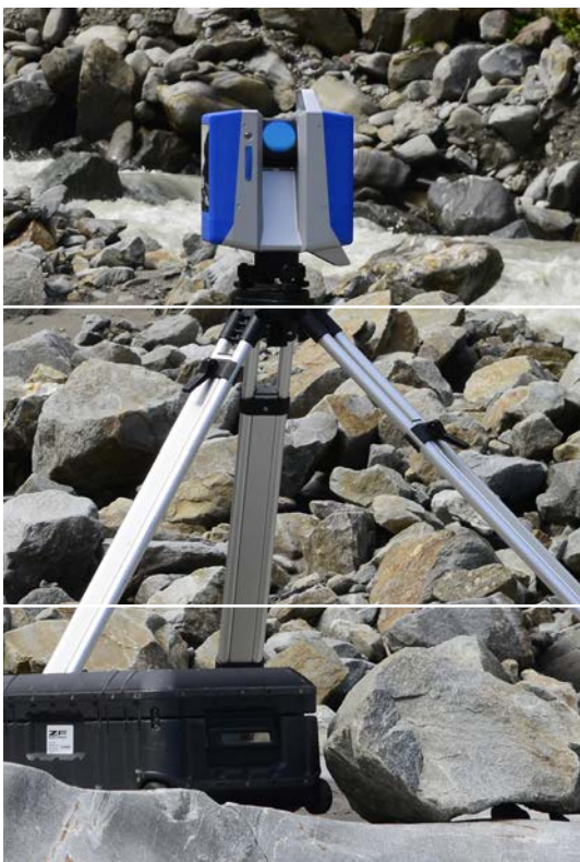
Z+F IMAGER® 5016

The occurrence of rockfall is a common sight for every visitor in an alpine region. It would be seen during a challenging hike towards a summit, or alongside a road that is located beside a steep rock face. This effect is triggered by various causes - cycles of freezing and thawing, pressure in cracks that are provoked by water or vegetation root pressure are common causes.