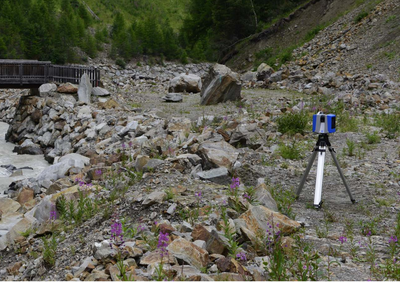
Captured spot that is subject to rockfall. Z+F IMAGER® 5016 in Obergurgl, Austrian Alps