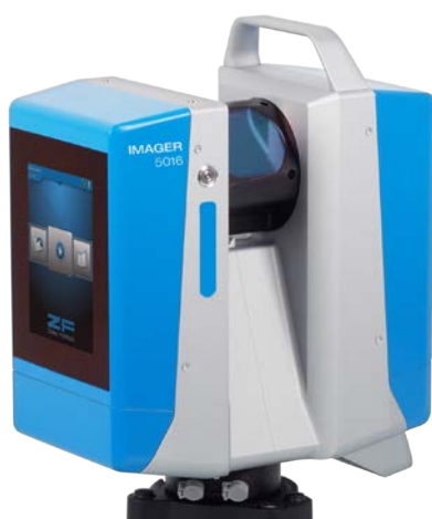
Z+F IMAGER® 5016