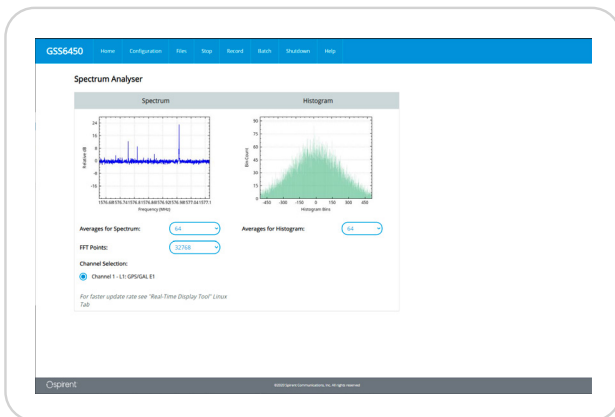
Onboard spectrum analyser

Multi-frequency GNSS and additional signals capability is helping in the shift towards multi-frequency, improving test coverage in just a single unit.